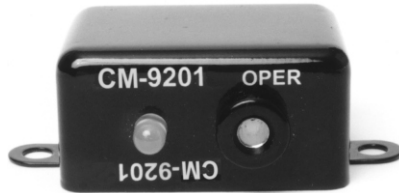
Item Number CM-9201