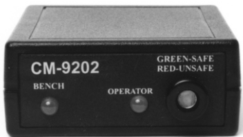
Item Number CM-9202