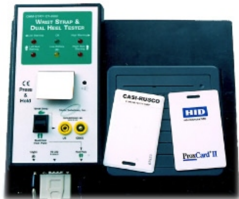
Item Number MTR-8900

Expand Your Measurement Capabilities by Downloading Data to Your Computer.